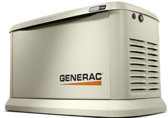
Product shown with optional fascia kit